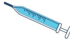
60 cc Syringe