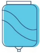
Gravity Feeding Bag

Important: If you have a jejunostomy tube, please contact your physician; do not use the gravity method.